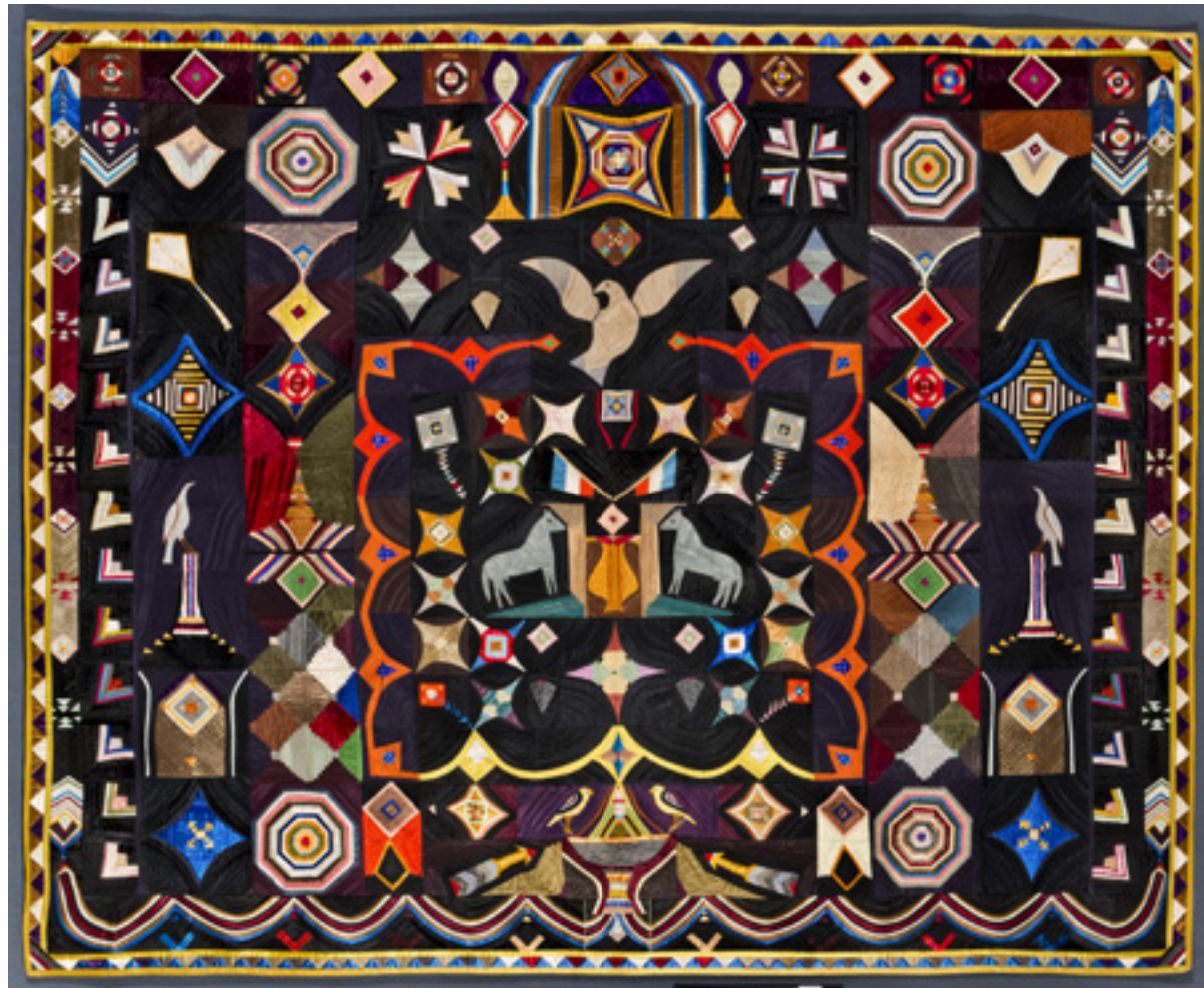
What That Quilt Knows About Me American Folk Art Museum March 17–May 28

Showcasing around 40 individual quilts spanning the 19th through 21st centuries, this exhibition speaks to how quiltmakers embedded their collective and individual histories into every weave and stitch, characterizing their work as live documents that hold keys to the past and its secrets. The featured quiltworks also push the boundaries of material and technique, with some examples incorporating elements such as photographs and paintings.