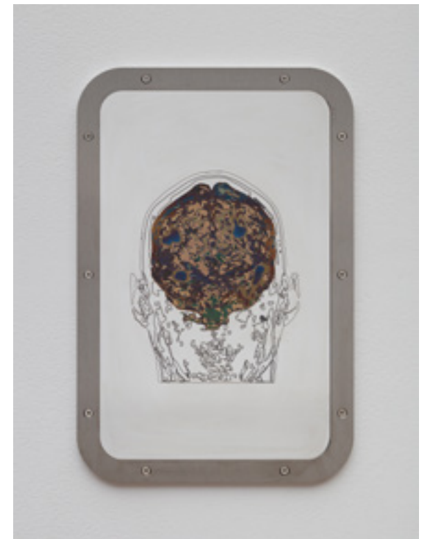
Sung Tieu: Infra-Specter Amant March 30–Aug. 27

Sung Tieu’s first solo exhibition in the US promises to introduce audiences to the artist’s research on psychological and informational control asserted by private and governmental entities, efforts typically hidden from public view. Tieu plays with fact and fiction to challenge the idea of universal truth, looking instead to the powers of information — or lack thereof.