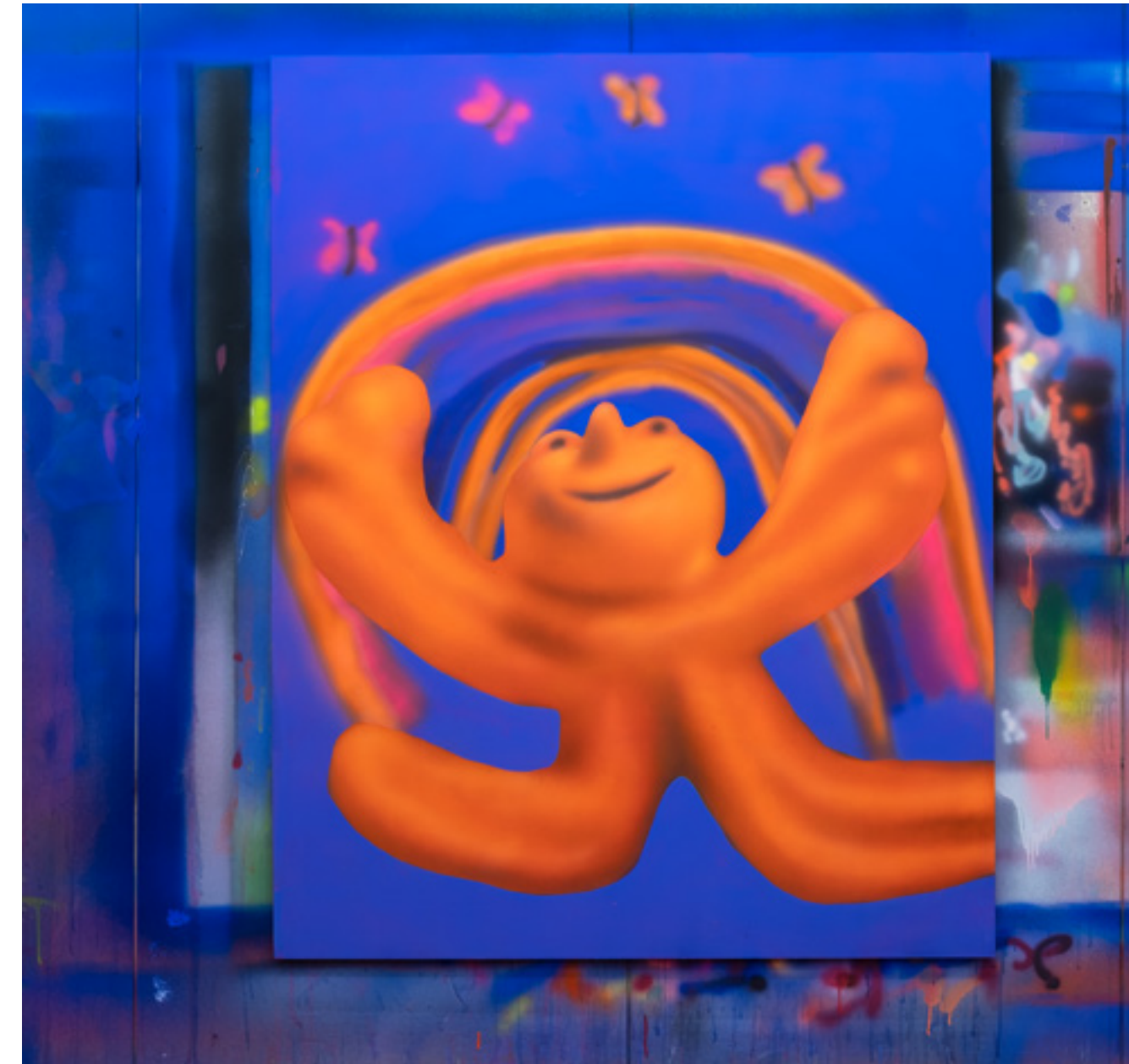
Austin Lee, “Joy” (2022), acrylic on wood, 64 inches x 51 inches (courtesy the artist)

615 West 129th Street Upper West Side, Manhattan