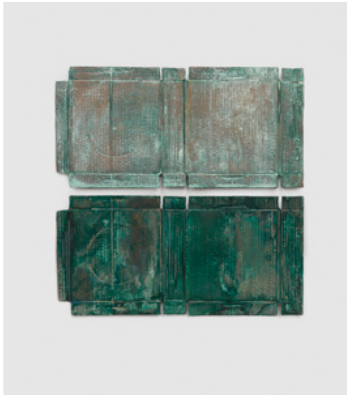
Rachel Whiteread Luhring Augustine March 10–April 22

Rachel Whiteread, “Untitled (Green)” (2020–2022), copper and patina (2 parts), 19¼ inches x 19¼ inches x 1 inch (© Rachel Whiteread; photo by Prudence Cummings Associates, courtesy the artist and Luhring Augustine, New York)