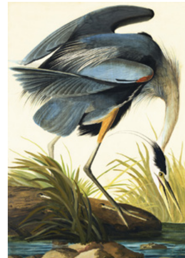
Nature, Crisis, Consequence New-York Historical Society March 31–July 16

There’s no shortage of warnings about environmental collapse these days, and no lack of information about the history of abuses that brought us to this point. Nature, Crisis, Consequence makes visible some of that US history and brings together works by a wide range of artists calling desperately for our attention, and action.